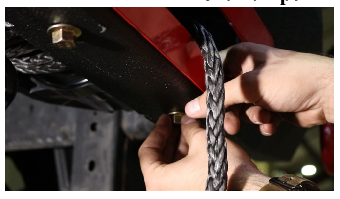
Install the two trim accents with the small nutplates and small nyloc nuts with a 5mm socket.