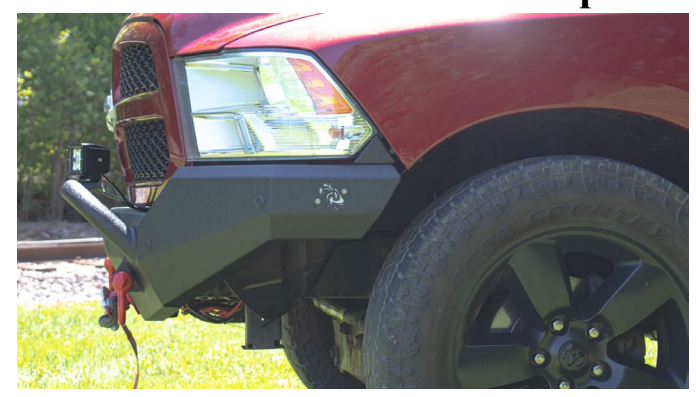
Install your pod lights.