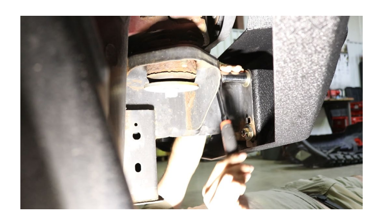
Install the winch plate with the remaining nut plates and hardware into the inboard bumper brackets.